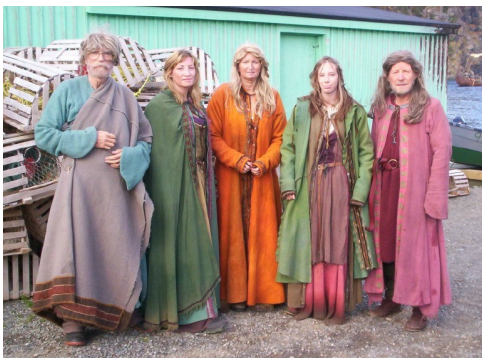
On the set of the movie "Outlander"